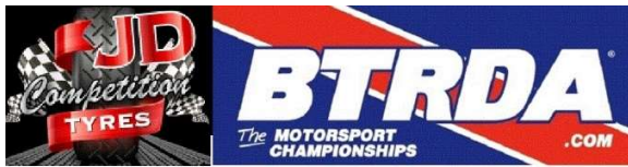
2026 BTRDA® Gold and Silver Star Targa Road Rally Championship